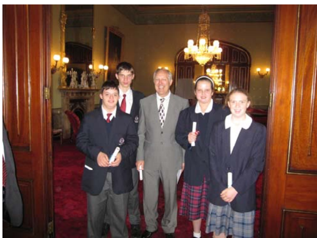
The proud recipients with their Awards