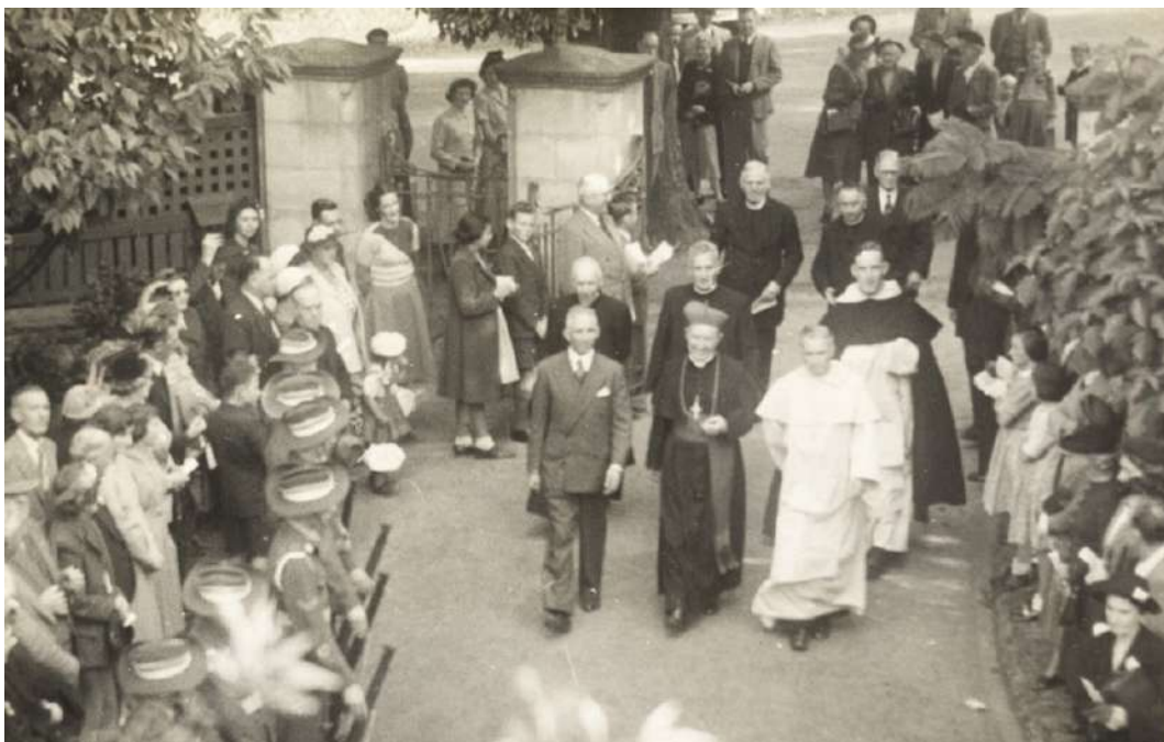
Cardinal Freeman and the official party process before the honour guard of St Pius X College Cadet Corp, Wahroonga Parishioners, families and guests, to bless and open St Edmund's Wahroonga just before ANZAC day on 19 April 1951.